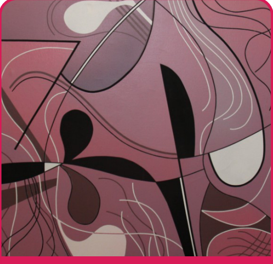
Renata Bernal A modern artist from America. She works using various drawing mediums including ink, pastels and acrylic.