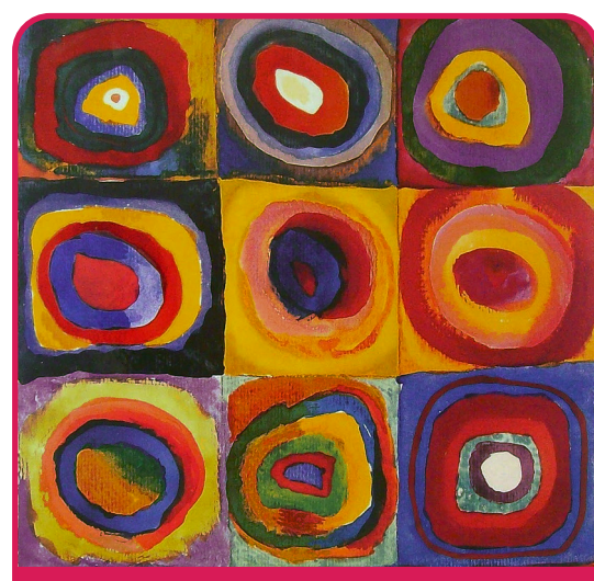
Wassily Kandinsky An artist from Russia. He was the first artist to create modern abstract art.

DACS, London 2020 Ilya Bolotowsky, Large Tondo, 1969 acrylic on canvas), Photo © Boltin Picture Library / Bridgeman Images