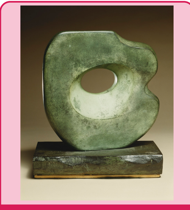
Barbara Hepworth An English artist and sculptor.

Title: Montagne Sainte-Victoire, 1904-06