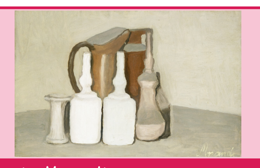
Giorgio Morandi An Italian painter and printmaker who specialised in still life.

Artwork © DACS 2020 Giorgio Morandi, Still-life, 1950 (oil on canvas), Photo © Bridgeman Images