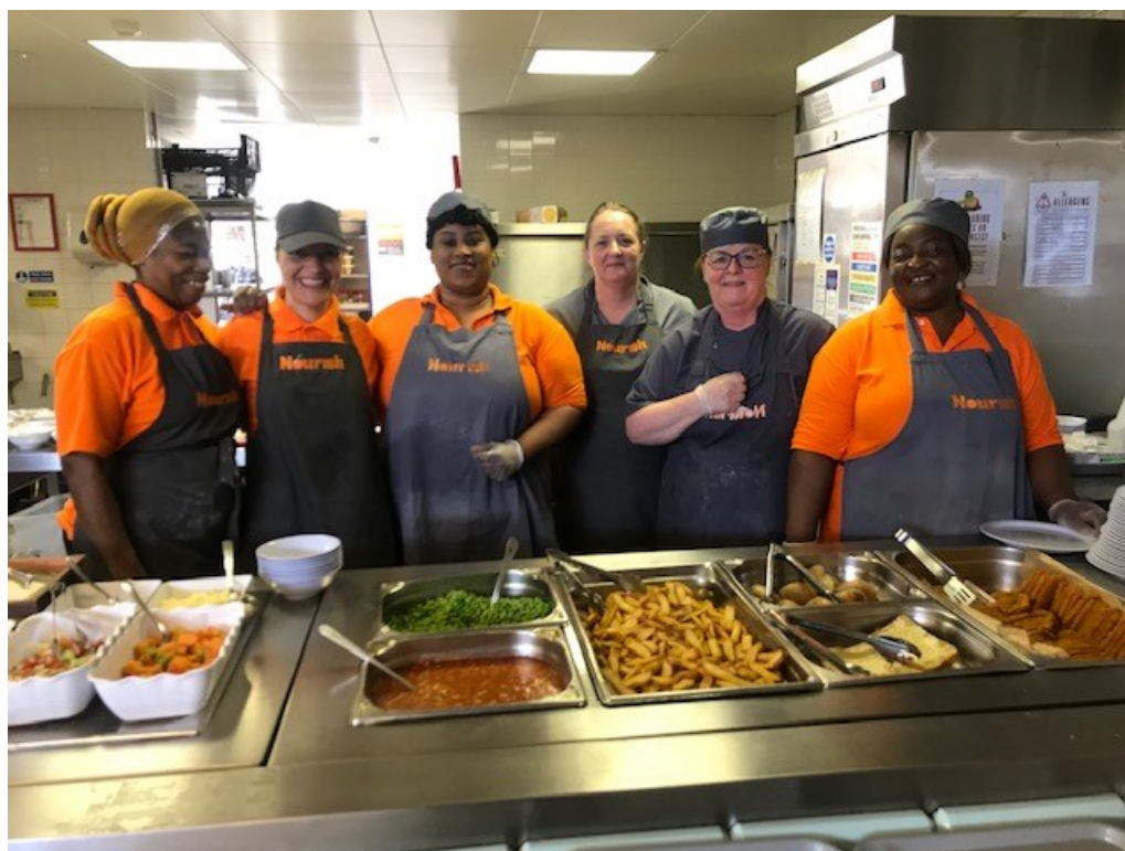
Head Chef (second from right) with kitchen staff

We would like to sincerely thank her for all her hard work and wish her every success in the future.