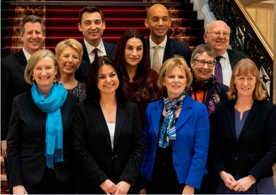
MPs who work in the House of Commons.

Three key stakeholders need to be involved in order for a new law to be passed.