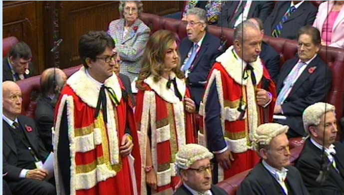
Members of society who are experts in various industries who work in the House of Lords.