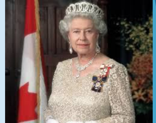
The Queen signs off a proposed law if both the House of commons and Lords agree.