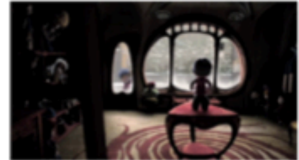
Travelling to New Location