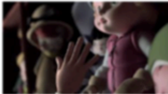
Interacting with Object