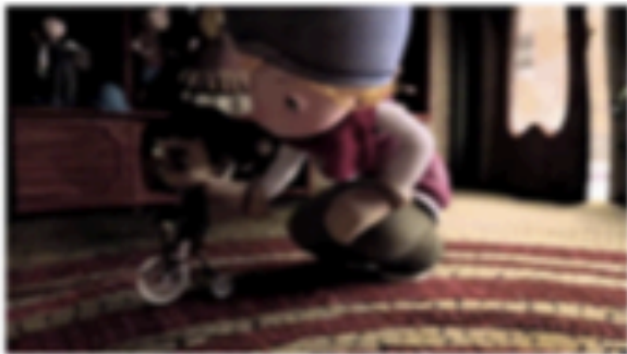
A Hint or a Warning